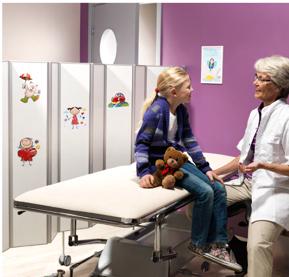
Silentia folding screen with Print Collection laminate.