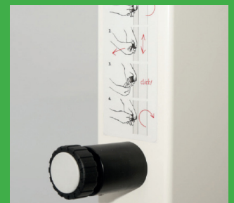
Easy height adjustment (gas spring mechanism).