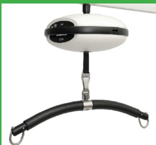
Luna ceiling hoist mounted on the Mobile Flex