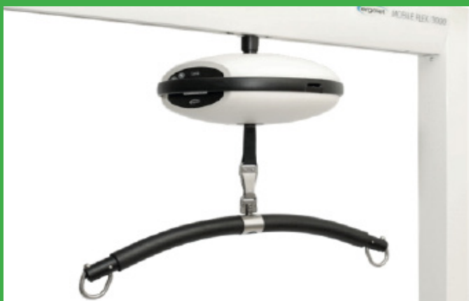
Luna ceiling lift mounted on the Mobile Flex