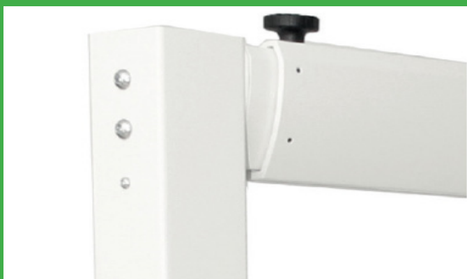
Easy to adjust width without using tools