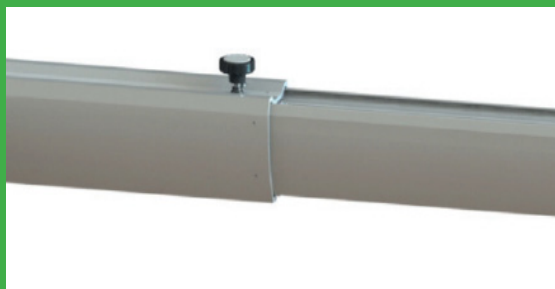
Easy to adjust the width of the gantry without tools