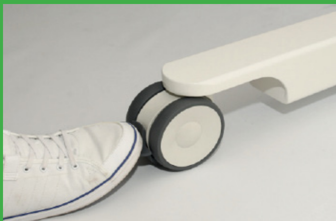
Two sets of wheels with brakes. Simply step on the pedal to brake.