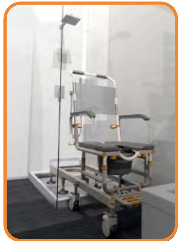
SB1 transfers into a standard shower that is not accessible